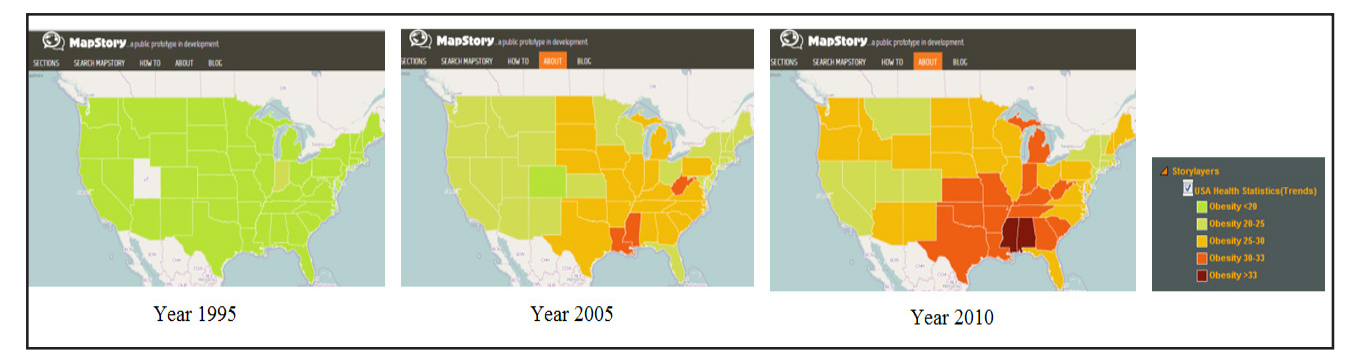
Figure 3. The study of the obesity in the states using the MapStory platform

ecology, and historical of the Boston city area. Figure 2a shows the border crossings between African countries and the widelife species in each location. Figure 2b presents the percentage of African American in Each district area, where the dark red presents the highest percentage and the light yellow presents the lowest percentage.