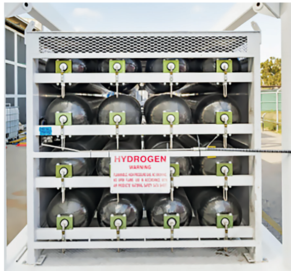
Figure 1: Hydrogen storage tank [9].

The stored hydrogen is used in the SOFC system as a fuel for electricity generation whenever power is required. There is an output of 50 kW in fuel cell mode within a 20 ft container but the output power is predicted to be improved to around 200 kW to 250 kW in the future [9]. This is a comparatively new fuel cell